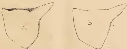
FIG. 4.—A, Orchelimum pulchellum ; B, O. nigripes : side view of thorax.

While this species resembles Orchelimum nigripes , Scudder, it is certainly distinct, being differently coloured, and having other characters, as may be seen from a series of both species. The name Orchelimum pulchellum is proposed for this beautifully-coloured insect. Mr. Louis